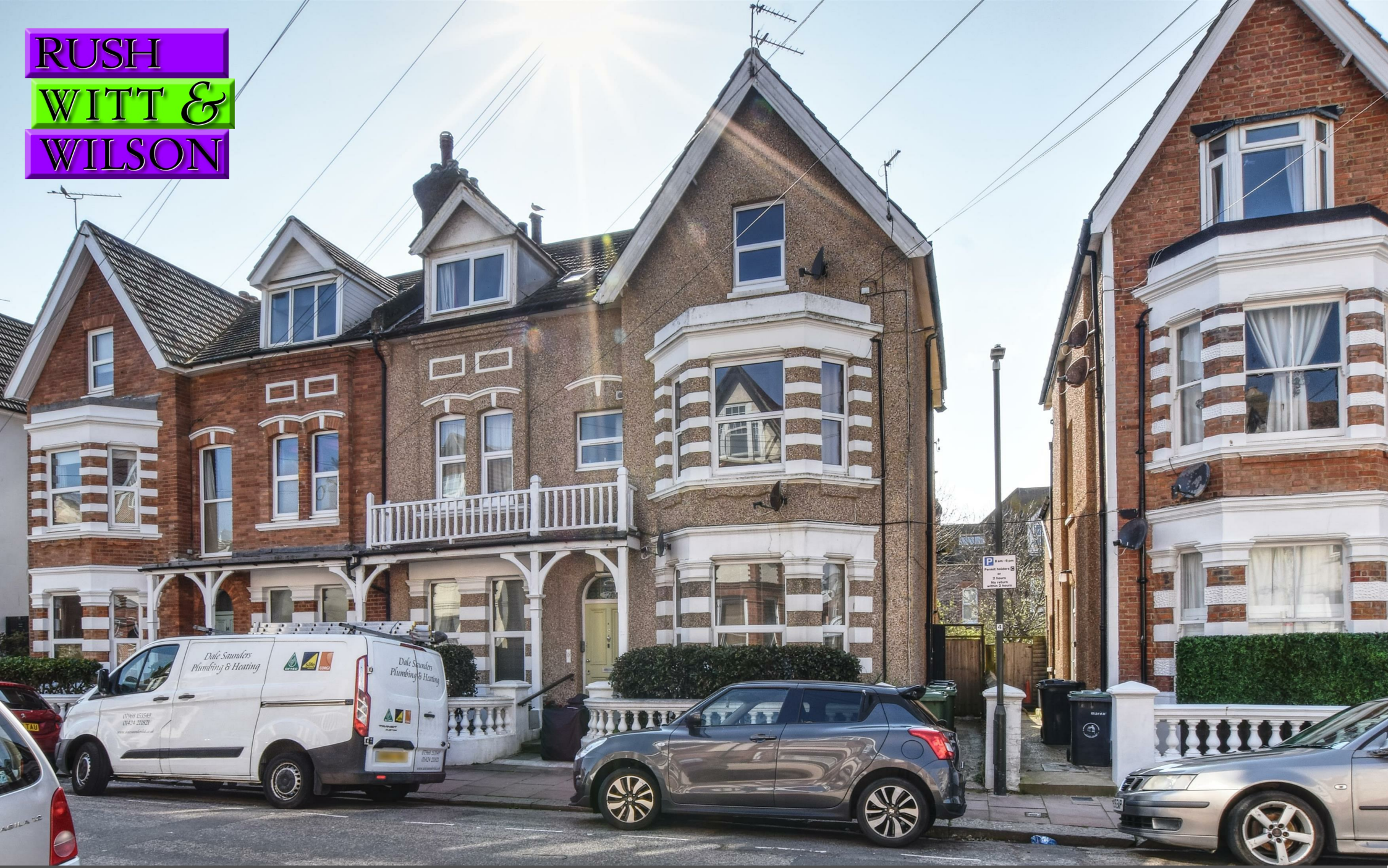
12 Albert Road, Bexhill-On-Sea, East Sussex TN40 1DG £280,000